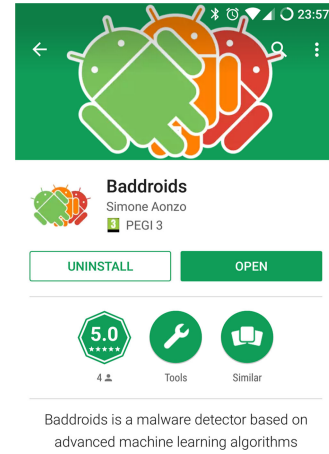
Fig. 1. BAdDroids on the Google play store.

baddroids.smartlab.ws. The dataset has been also submitted to UCI [67].